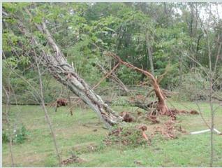
Damage from Isabelle